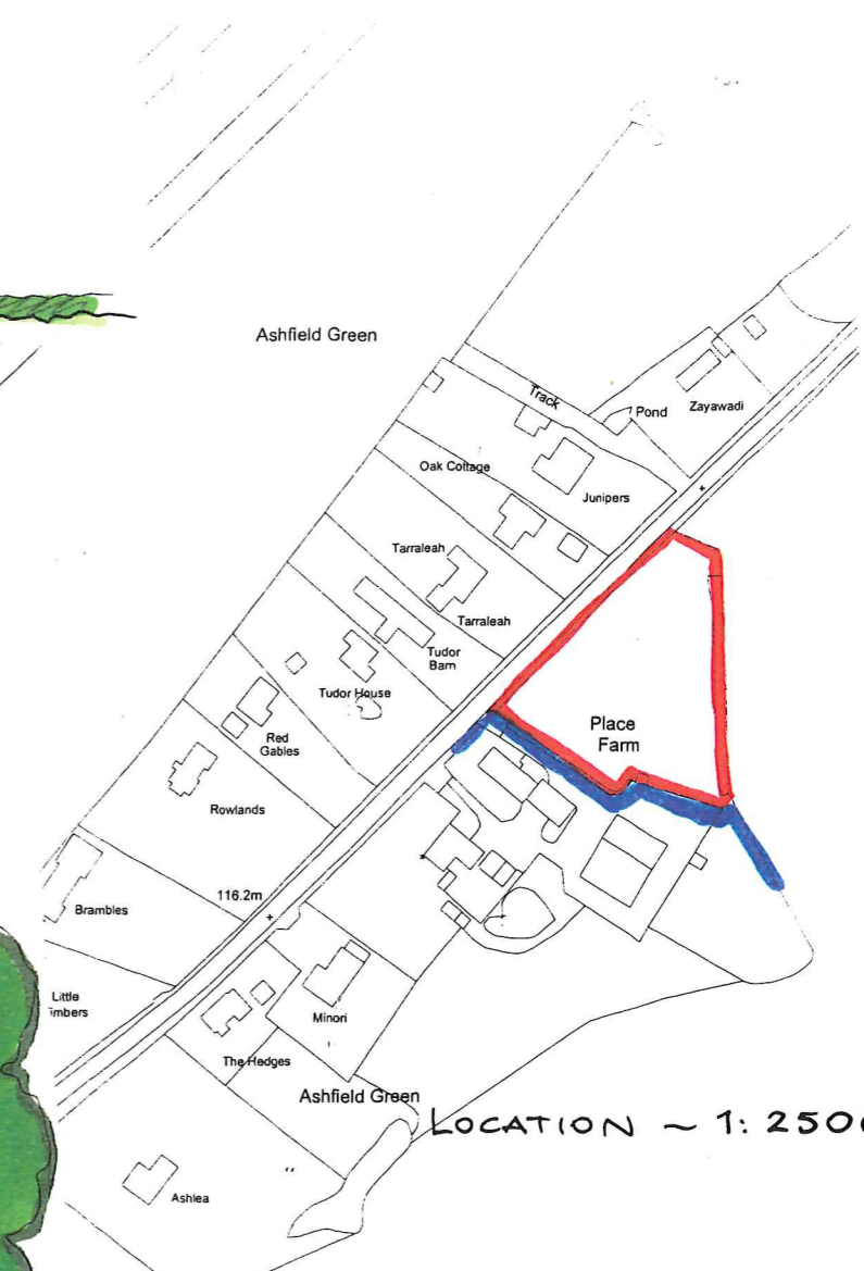
LOCATION ~ 1:2500