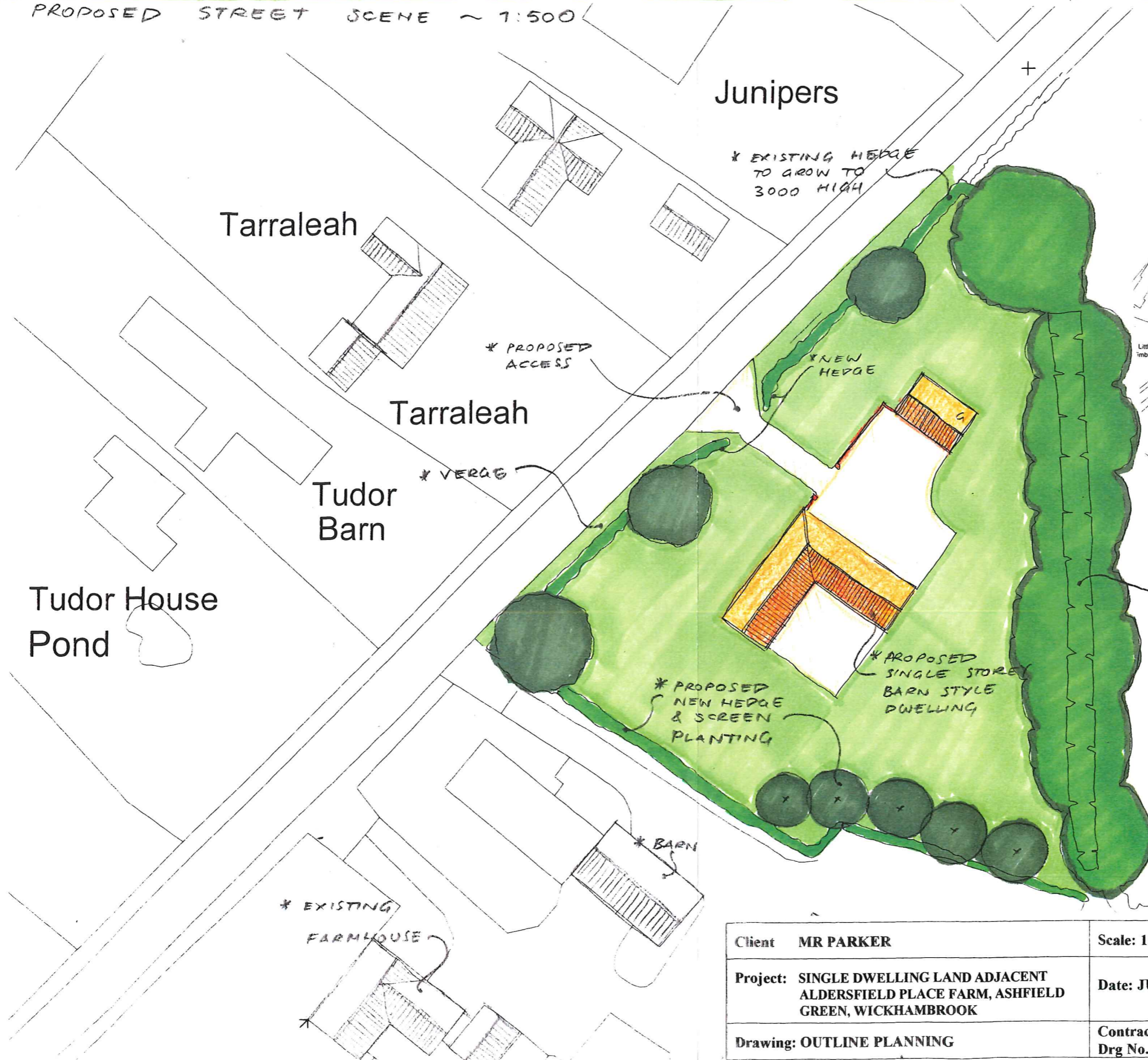
SITE LAYOUT ~ 1:500

* RENOVATE HISTORIC DITCH & PROPOSED TREE MANAGEMENT